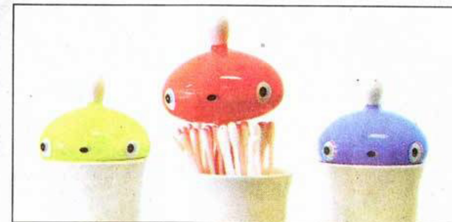
Pisellino cotton bud holder.