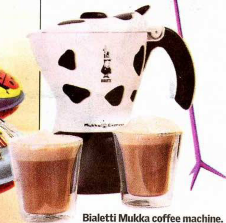
Bialetti Mukka coffee machine.

The Good Store, Shop 2, 363-367 Albany Highway, Victoria Park. Phone 9361 8271. Gift vouchers are available.