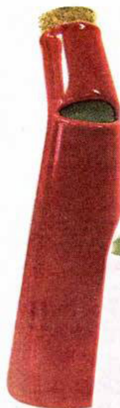
Salad Song (cruet set).