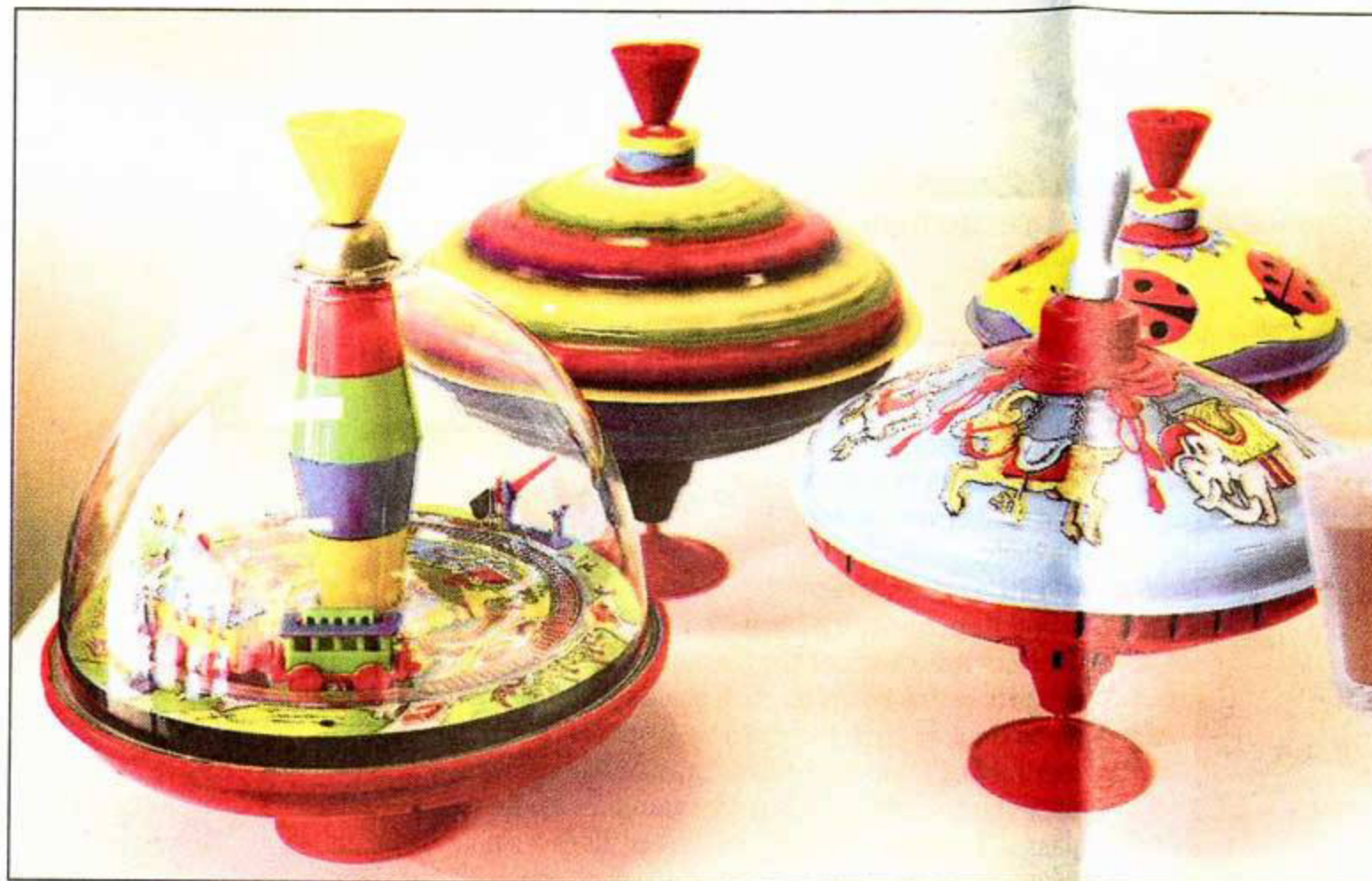
The shop offers a range of colourful spinning tops.

Take the Baggy Green caps for example. Manufactured by the